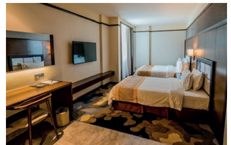
FAMILY DELUXE 30m 2 Comes with one Queen bed and one super single bed