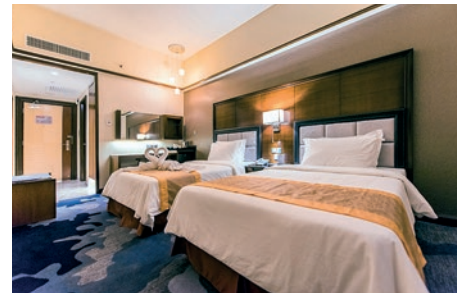
SUPERIOR TWIN 22m 2 Comes with two super single beds