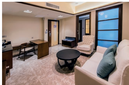
PREMIER SUITE 63m 2 Comprised of a bedroom (selection of a King bed or twin beds) and a separate living room