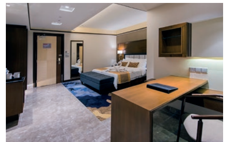
NU SUITE 42m 2 Comes with one King bed