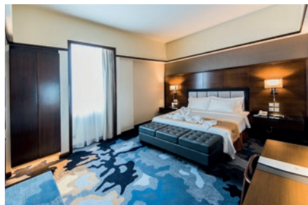
DELUXE 30m 2 Comes with one King bed